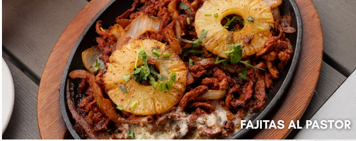
FAJITAS AL PASTOR