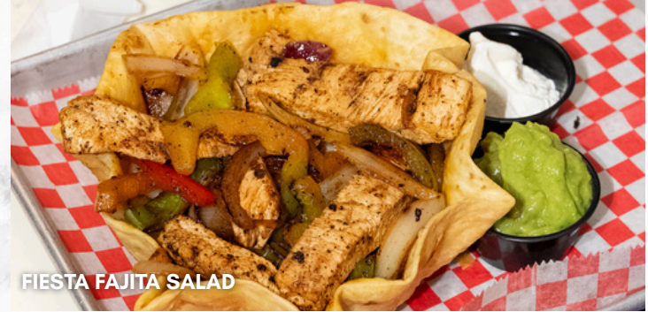
FIESTA FAJITA SALAD

NACHOS LOCOS $22 With grilled chicken, shrimp, steak, beans, lettuce, tomatoes, guacamole, sour cream, pico de gallo & jalapeños